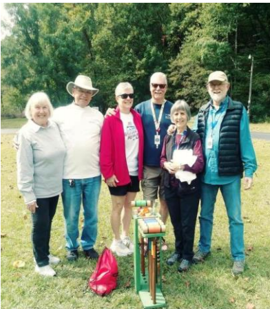
Good times and good friends during the Fall Rally