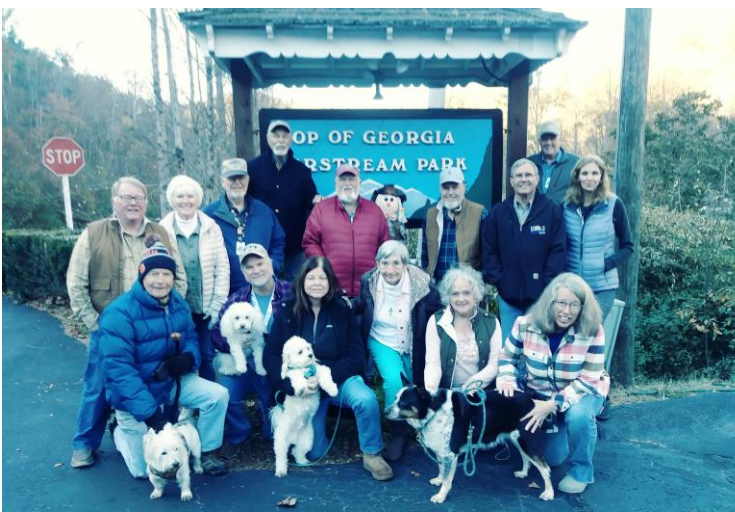
Alabama Airstream Sister-Rally Group