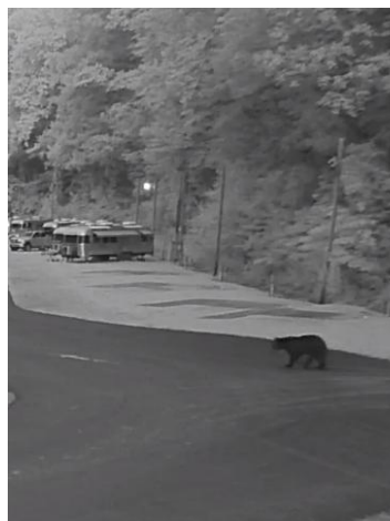
'Tis the season to be "Bear Aware"!