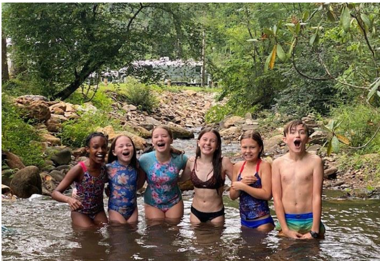
We thought we were having fun...little did we know we were making memories!