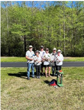
Some Spring Rally fun