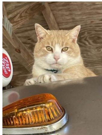
Wally – Keeping an eye on things