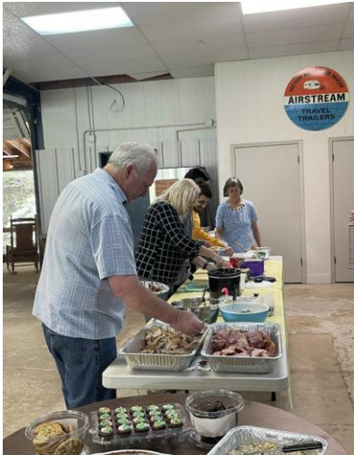
What a spread!