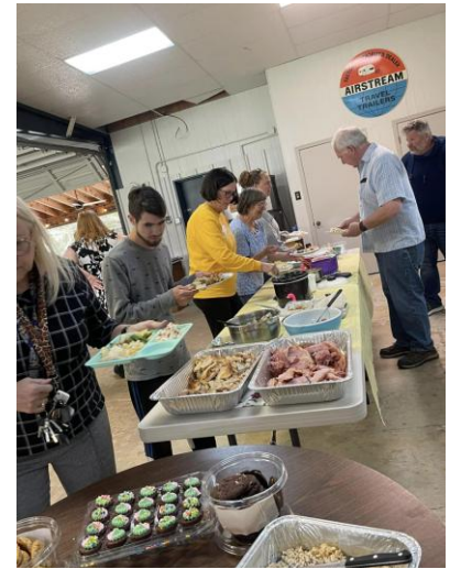
Did we mention, a LOT of food!