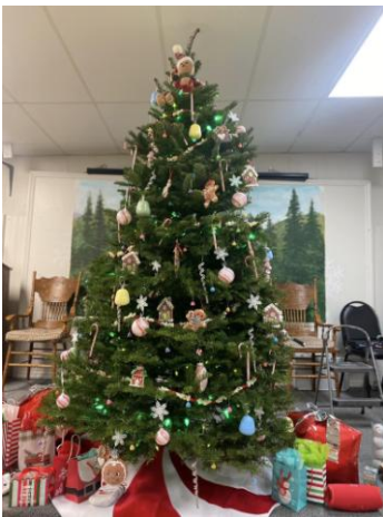
Christmas Luncheon pg 10