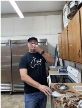
Just making sure it tastes okay!

Members, friends and families were invited to our annual Thanksgiving potluck. Smoked turkey, oven roasted turkey, smoked ham and all the stuffing, gravy, green bean casserole, side dishes and desserts you could eat.