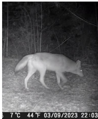
A coyote wandering our mountain trail – Trail Cam temporarily placed by David Cardoza