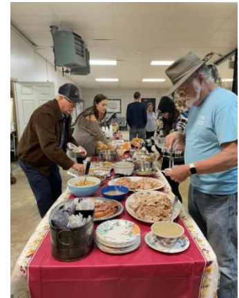
Did we mention, a LOT of food!