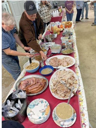
So much food!