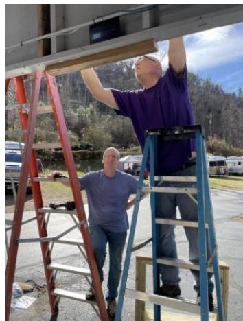
Park Upgrades – pg 3