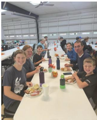
Always happy to make new friends!