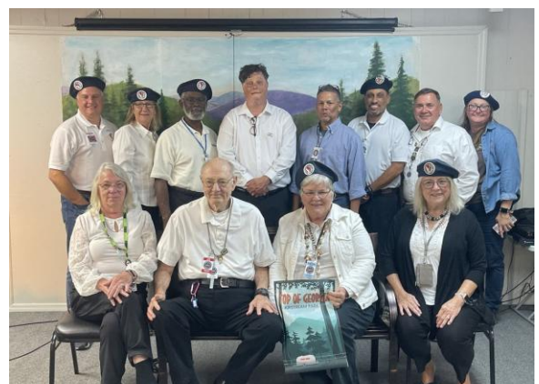
Welcome, 2023 Board Officers and Directors