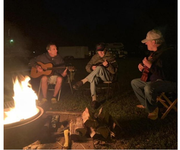
Music, campfire and good friends