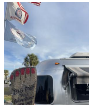
Getting some time in the sun at Ocean Lakes in Myrtle Beach, SC