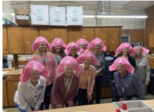
It's Breast Cancer Awareness Month