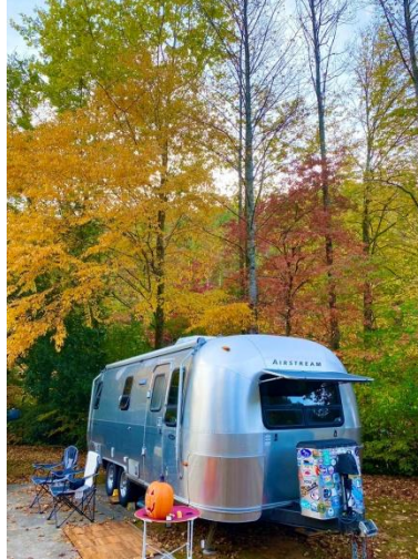
Beautiful fall colors