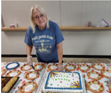
Celebrating October birthdays