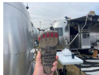
Amidst the many Airstreams at Alumalina 2022 in Marion, NC

So curious where my travels with these shiny trailers and their curious, explorative owners may take me next..."