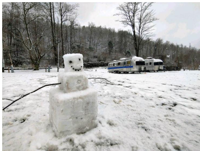
Wonderful Winter land

Behold, my friends, the spring has come.