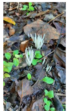
Fairy Fingers Ghost Fungus