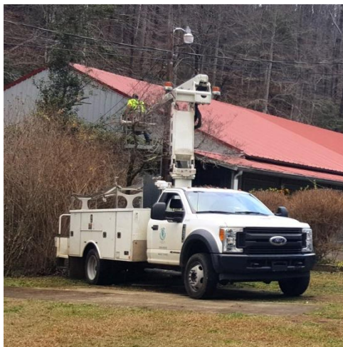
Fiber Optic Wi-Fi is Live in the Park