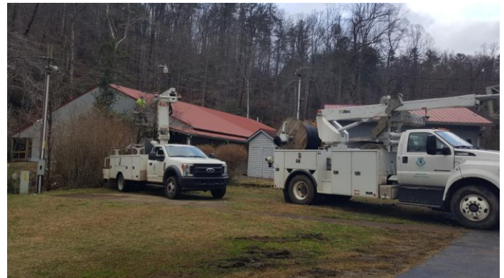
This was quite the project. Thank you to everyone involved!