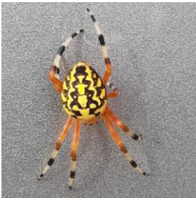
Weaver orb spider