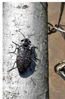
Eastern Eyed Click Beetle