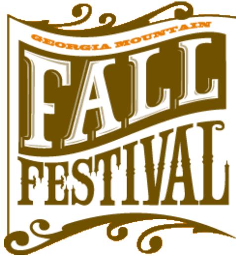
Upcoming Events (pgs 12-13)