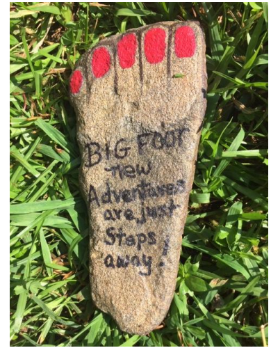
From the Archives (pg 14)

“Traveling – it leaves you speechless, then turns you into a storyteller.” – Ibn Battuta