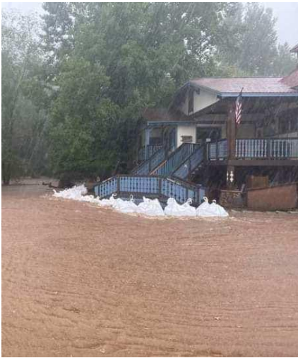
Tropical Storm Fred (pg 5)