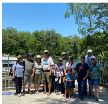
Visit to nearby Wakulla Springs

The purpose of the Region 3 is to have a business meeting and discuss plans for the Region and for the International Convention this summer. But most folks come for the fun, the food, and the entertainment. A good time was had by all.