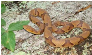
Copperhead snakes and Timber Rattlesnakes are common in North Georgia

Members may invite their friends and family members as buddies when the member is in attendance. Members may invite a maximum of two RV buddies who may stay as long as the sponsoring member remains in the park. They also pay the same member nightly rate!