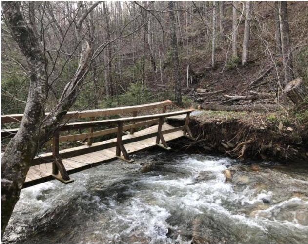
Storm Damage (Pg 3)