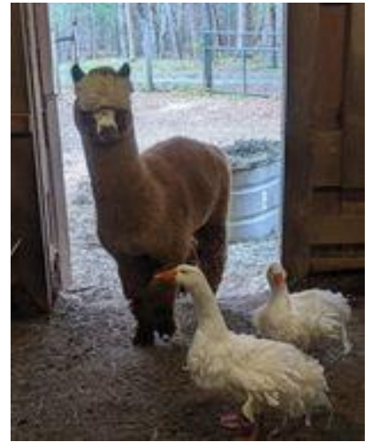
Rally fun! (Pgs 6-7)

"Life was meant for great adventures and close friends."