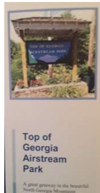
TOG Promotional Brochure