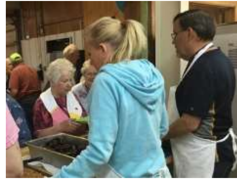
Serving in the kitchen