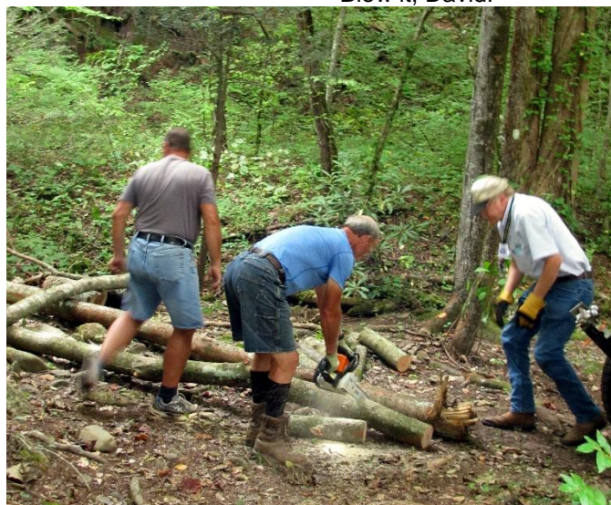
Plenty of hands to clear the downed tree