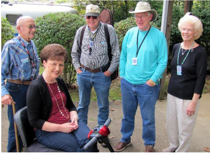
Chewing the fat....