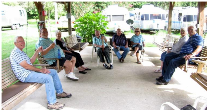
The Pine Tree Forum