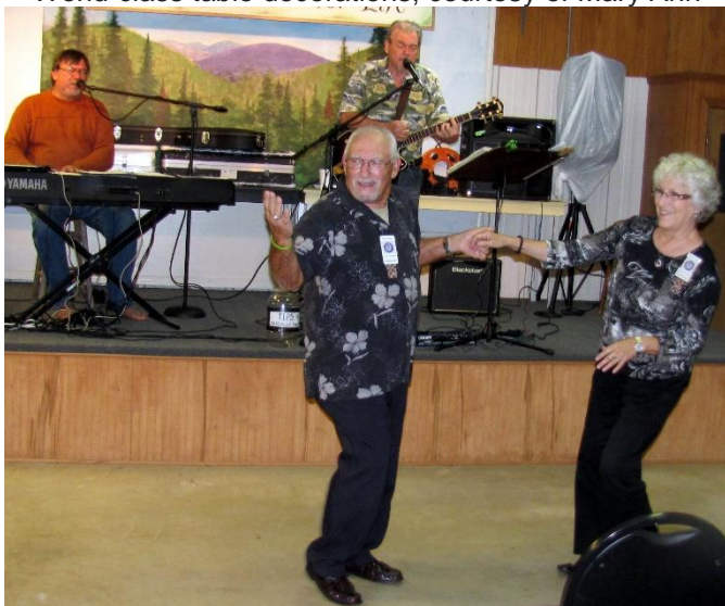
Come join us!