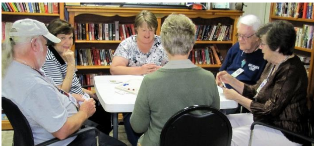
An old favorite: cards in the library