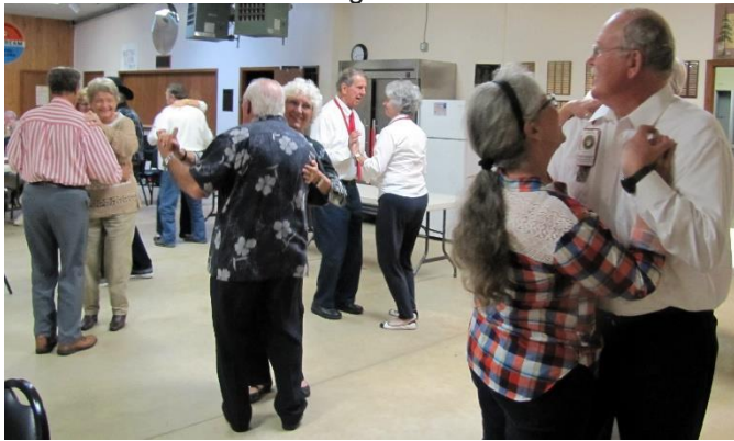
That soft, sweet, celestial music of the spheres....