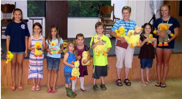
Everyone's a winner in the duck race!