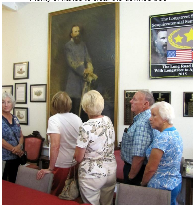
A fascinating tour of the Gen. Longstreet Inn at Gainesville