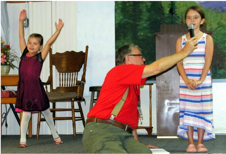
The kids' talent show: preview the stars of tomorrow!