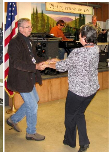
Can't sit still!