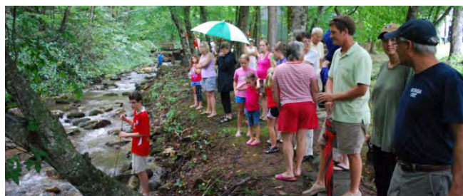
The gallery for the Classic Duck Race