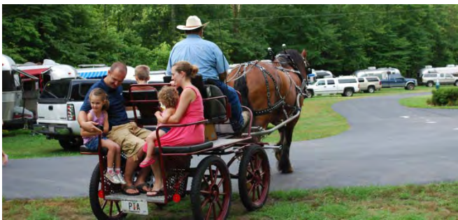
Clydesdale cart rides were a hit!