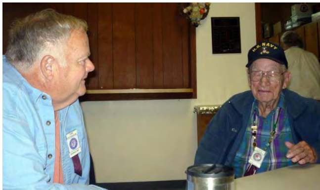
Some of the best conversations are at the table.