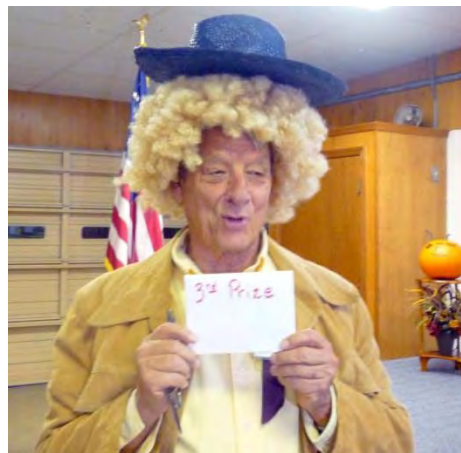
We all knew Charles was a clown....