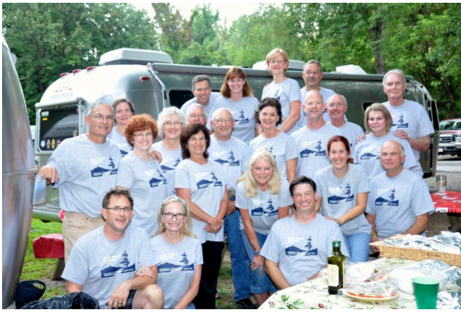
Georgia Unit Caravan participants enjoy their first meal on the road.