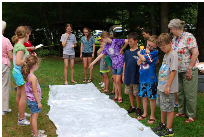
Watermelon seed spitting...fierce competition!