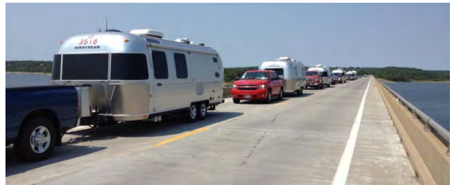
Caravan to Sedalia International Rally