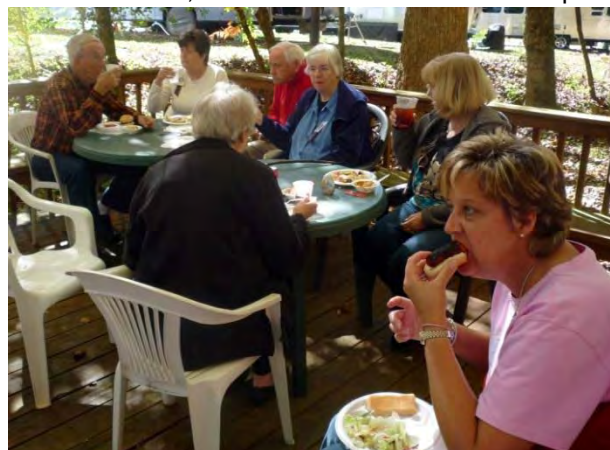
Sunday afternoon at the firepit—a rally favorite