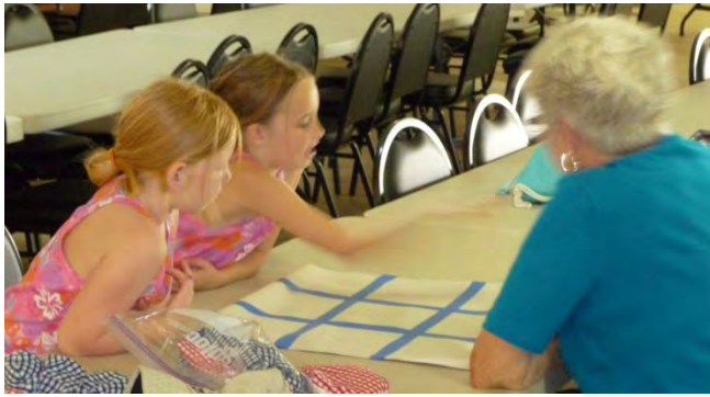
The generations mingle with crafts