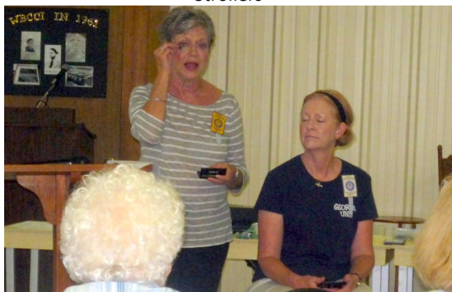
Pretty enough already!