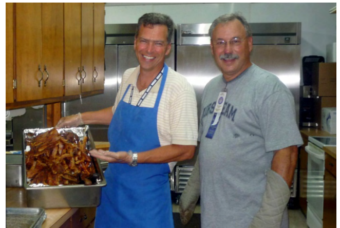
Getting a head-start on breakfast