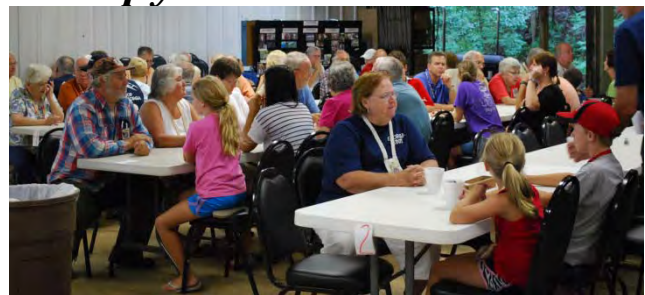
They didn't have to call twice when the Low Country Boil was ready!

This is to remind all members that rent/parking fees are due when you leave or, if you leave your camper for an extended time, every 30 days...not when you just have a whim to pay! Your Airstream Park is the greatest "deal" in Georgia—and beyond—and your park has regular expenses coming due every month as well. Please help keep our rates reasonable by making the job easier for those who must meet our regular obligations and keep your account current!