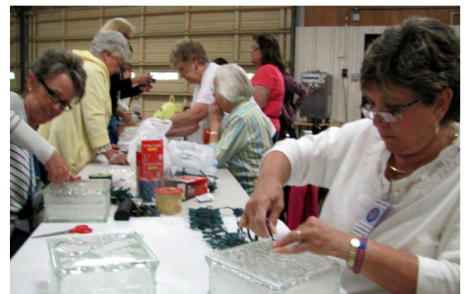
Ladies' crafts—something to take home

Please note: The new telephone number for Helen's Riverside Café, one of our directory advertisers, is 706-878-7627; they also are in a new location. The menu is on the bulletin board, and a few discount coupons might be there as well.