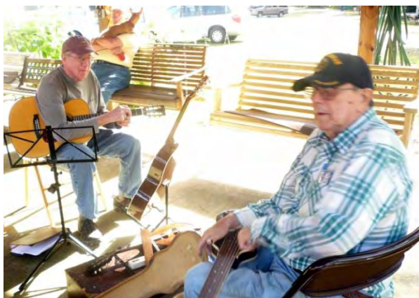
Spontaneous music under the pine tree