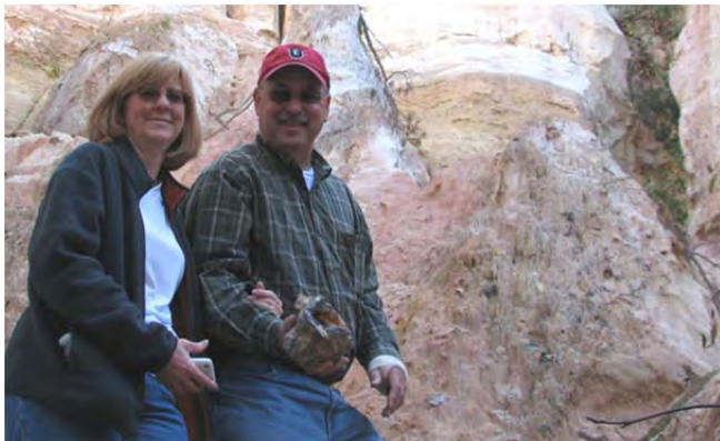
Winter hiking at Providence Canyon State Park

Plans are still forming; ideas are welcome!