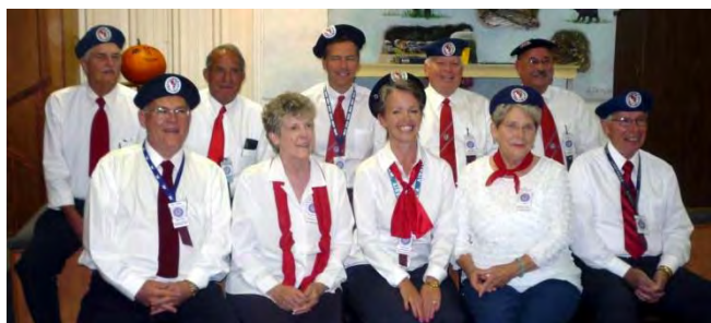
2013 Officers were inducted at the Fall Rally banquet.

Fain Edwards' daughter carved the winning pumpkin.