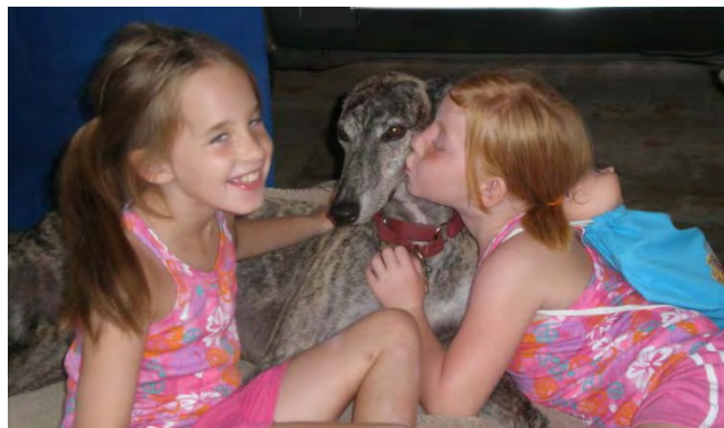
Kids and dogs...nothing like 'em!