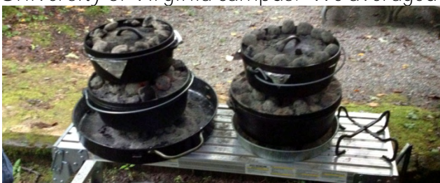
Cooking dinner for 22 on the road

While you may normally travel 469 miles in a day or two, the Parkway offers a different type of travel. They say it's about the journey, not the destination; but for this trip the journey was the destination. Along the way we traveled through Cherokee, ate at Mt. Pisgah, toured parts of Asheville and Black Mountain, experienced the Diamond Back at Little Switzerland, experienced the beauty of the Moses Cone Mansion, visited the Blue Ridge Music Center, enjoyed Mabry Mill, ate and slept at Highland Haven, toured Monticello, experienced Montpelier, learned about Virginia wines, and wandered about the University of Virginia campus. We averaged