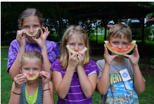
Smiles all around