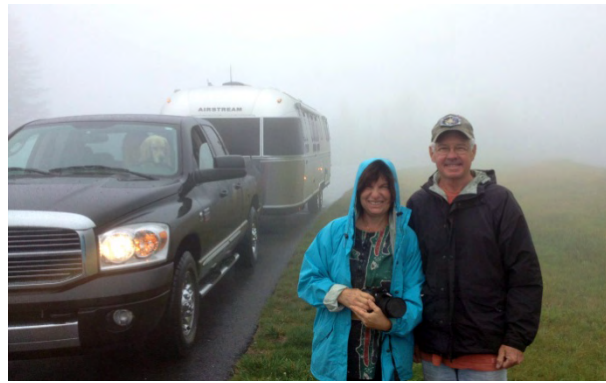
"Touching the Clouds" blanketed by Clouds

about 120 miles, a dozen overlooks, and two Parkway visitor centers per day.