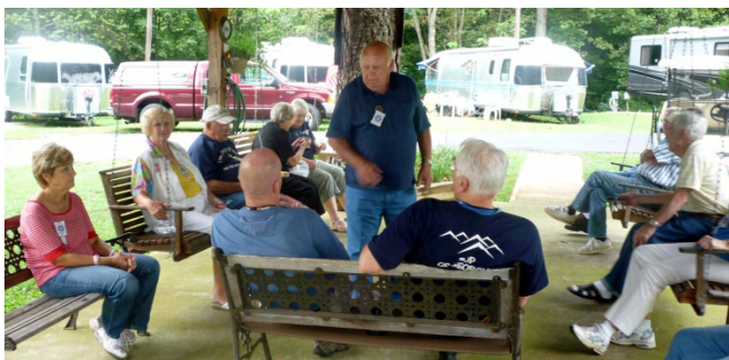
The "Pine-tree Swingers"