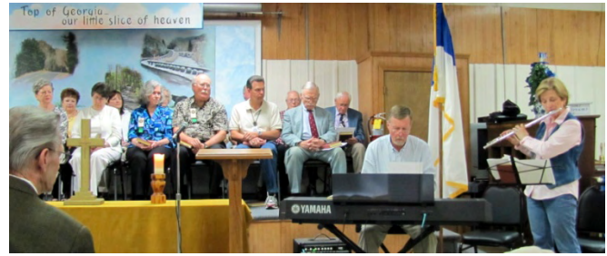
A four-part choir with instrumentals—a TOG "first?"