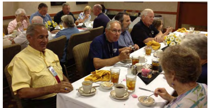
Region 3 Luncheon at Sedalia International Rally