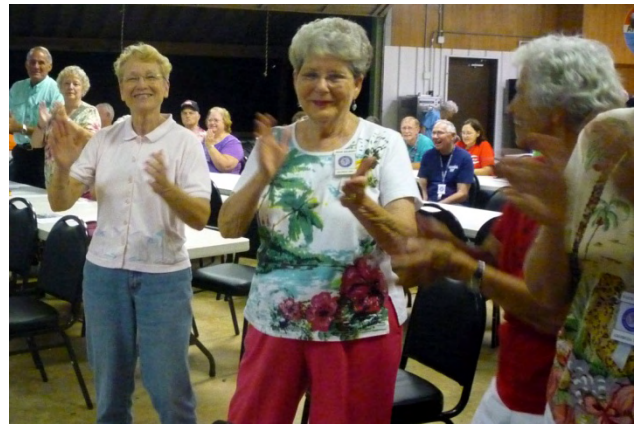
In the spirit

If you have suggestions for nearby sites, restaurants, tours, or activities, please let us know.