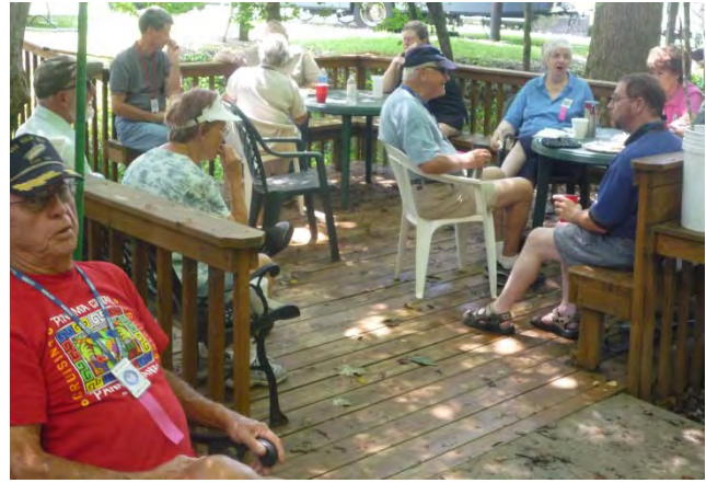
The deck and fire pit—a favorite gathering spot.

Georgia Department of Tourism's web site http://www.exploregeorgia.org/NortheastGeorgiaMountains has monthly activities of interest to TOG members who come between rallies; you'll find quite an active group of "regulars" if you come up between times. One example just below Helen is Sautee-Nacoochee. According to the tourism web site, "Music, dancing, art, food, history and culture are the heartbeat of this small mountain hamlet. Native Americans built the Sautee Nacoochee Indian mound which stands today as a testament to their lasting footprint upon the land. The slave cabin on the grounds of the Sautee Nacoochee Center offers a look into a small portion of the area's heritage and culture along with the renowned Folk Pottery Museum of Northeast Georgia—functional works of art created by mortal hands but often displaying the creative soul within. The Stovall Covered Bridge is a testament to an era gone by. The Gourd Ladies at The Gourd Place mix the new with the old, sprinkling a little imagination. People often send their personal gourds from around the world to add to the collection at the International Gourd Museum. Vineyards dot the landscape and several tasting rooms have opened up giving visitors the chance to enjoy the local 'fruit of the wine.'"