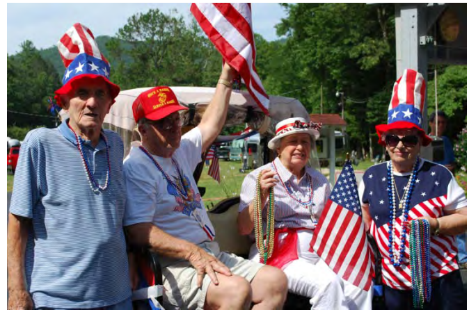
Kids come in all ages!