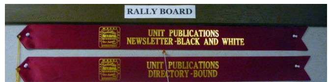
International red-ribbons for Caravanner and directory