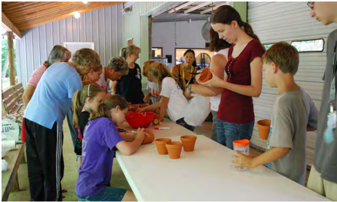
Gone to pot...planting in decorated pots