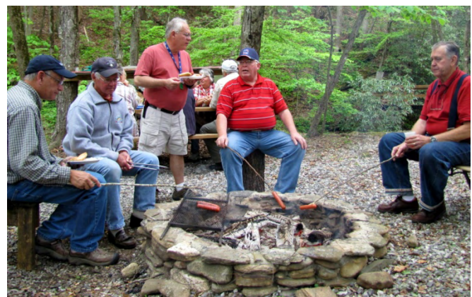
"Tube steak" around the fire pit after church