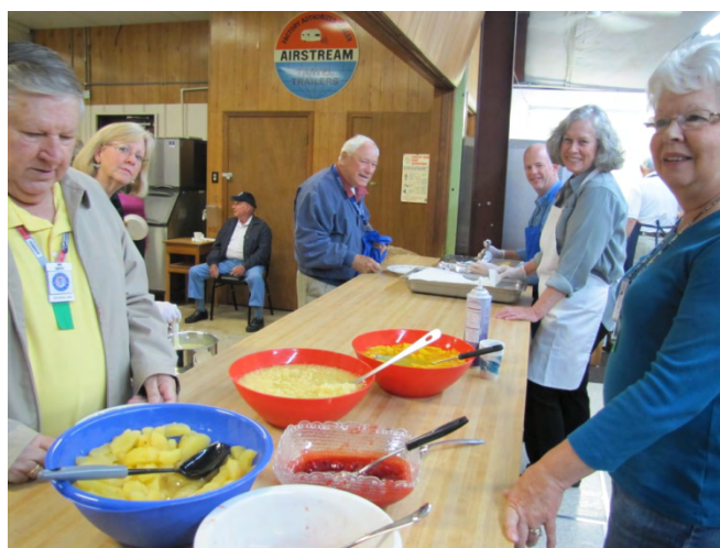
The kitchen crew--our favorite folks.