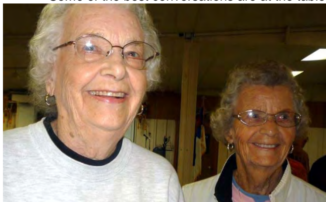
A million dollar smile!