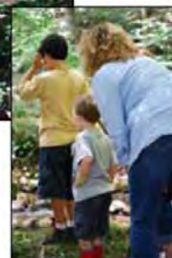
Scenes from last year: 3-legged race, balloon toss, and watching the ducks race down the creek.