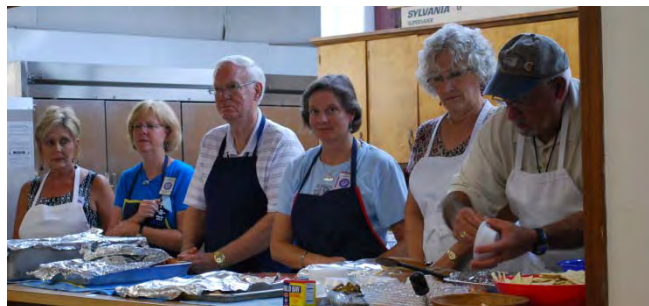
Can't live without 'em